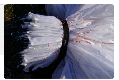
Step 3. Lay wing on its side and Strap LE...Note the glider is NOT folded in half; it is folded with a complete concertina from tip to tip. It is really important to not stress the middle cell or bend the plastic too tightly.