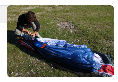
Step 8 . If using the Saucisse Pack, carefully zip it up without trapping any material.