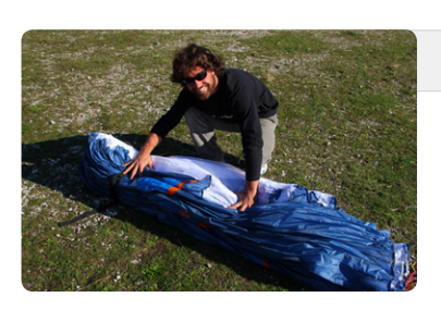
Step 5. Once the LE and rear of the wing have been sorted, turn the whole wing on its side.