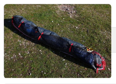
Step 9 . Turn the Saucisse on its side and make the first fold just after the LE reinforcements. Do not fold the plastic reinforcements, use 3 or 4 folds around the LE.